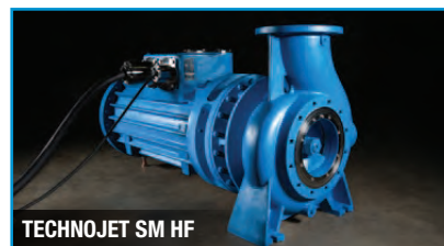
TECHNOJET SM HF